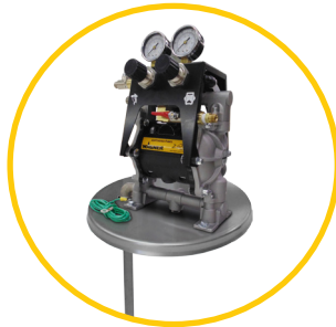
5 Gallon Pail Mount