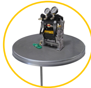
55 Gallon Drum Mount

WAGNER Systems Inc. 1770 Fernbrook Lane Plymouth, MN 55447 T 800.473.2524 F 630.503.2377 www.wagnersystemsinc.com